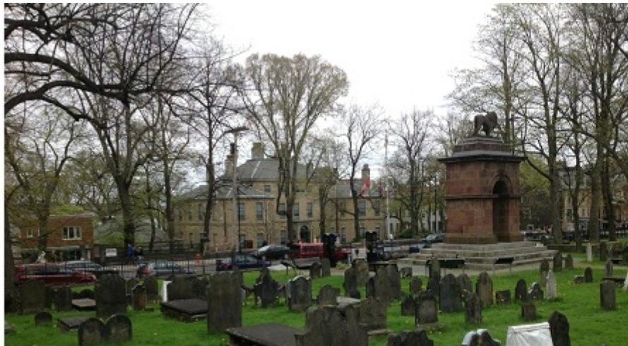
Old Burying Ground with Welsford-Parker Monument

Located on the corner of Barrington Street and Spring Garden, across from Government House, the residence of the Lieutenant Governor of Nova Scotia, the Old Burying Ground in Halifax has a busy location. The government of Canada recognized it as a National Historic Site on March 1, 1991 in part because "it bears witness to the complex cultural traditions of early British North America." (2)